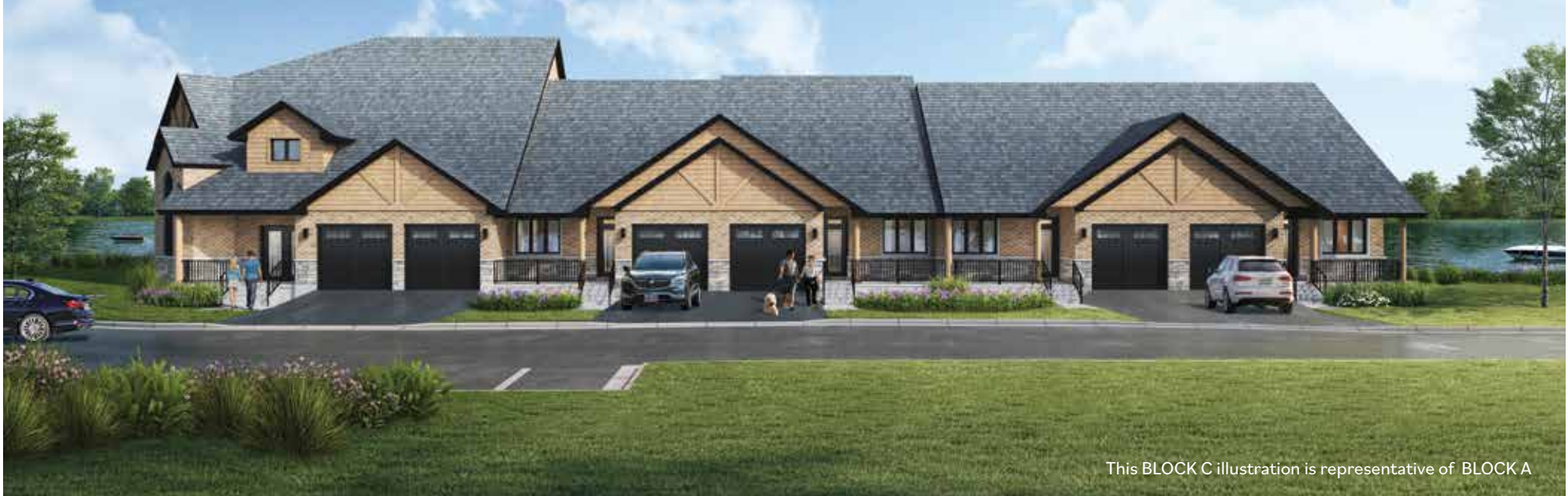
This BLOCK C illustration is representative of BLOCK A

INTERIOR BUNGALOW TOWN Approximately 1,205 SQ. FT. END BUNGALOW TOWN Approximately 1,230 SQ. FT. OPTIONAL FINISHED LOWER LEVEL ADD Approximately 1,205 SQ. FT.