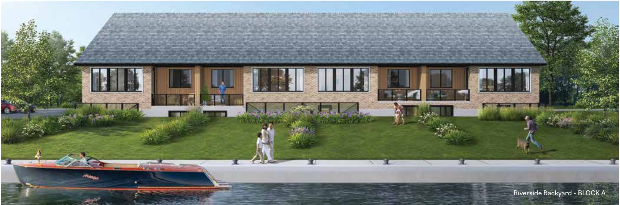
Riverside Backyard - BLOCK A